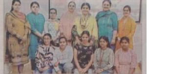
कविता दिवस के मौके पर आयोजित कार्यक्रम में हिस्सा लेने की एन.के.सी. डब्ल्यू. के विद्यार्थी अपने-अपने-अपने के साथ।

अज्ञान संवर्धन, लुधियाना में विश्व कविता दिवस मनाया। इस कार्यक्रम में गुरु नानक खालसा कालेज फॉर वूमन, गुजरखान कैम्पस में इंग्लिश-इंग्लिश लिटरेरी सोसायटी ने आयोजन किया। भाग लेने वाली टीमों में मास्टरस एम्प, सेल्ड, वेलजर्स एम्प वन, ब्रुक ब्लेज वीर सेल्ड आनर्स, लिट लवर्स वीर तीसरे आनर्स और प्रेज़ली बाउंड इंग्लिश